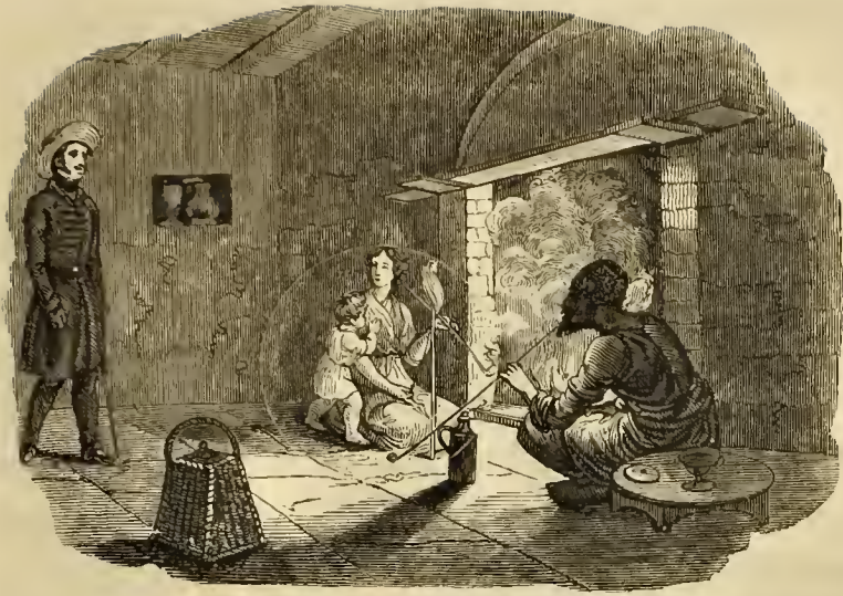
INTERIOR OF A TARTAR COTTAGE.